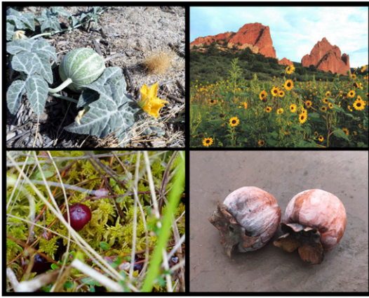
Fig. 1. Photos of four native CWR from the United States: Cucurbita palmata, wild Helianthus annuus, Vaccinium oxycoccos, and Diospyros virginiana.

targeting 1A taxa, particularly in their geographical hotspots of the Midwest to Mid-Atlantic and northwest coast.